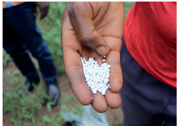
NPK fertiliser is widely used in agriculture