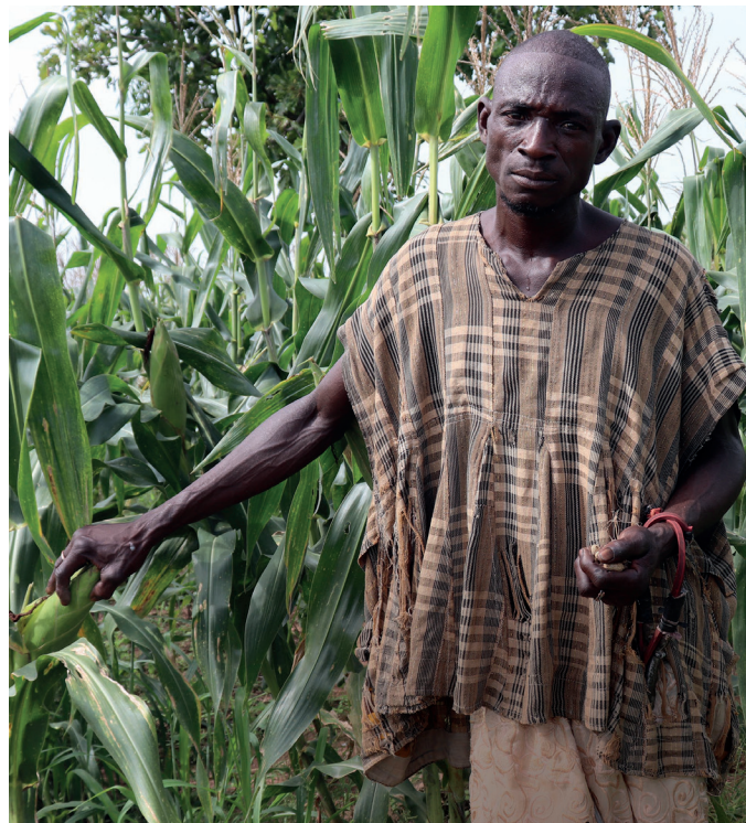
High yielding maize from a mechanised CF-minimum tillage farm plot

The NSEZ is particularly vulnerable to the anticipated changes in climate, as it depends heavily on rain-fed agriculture. Changes in the onset of rains, increases in the frequency and intensity of heavy rainfall events, higher incidence of low rainfall years, higher-intensity rainfall events and increased frequency and intensity of mid-season dry spells are likely to seriously threaten crop yields and agricultural productivity. This will be compounded if run-off and erosion is not checked, and if the soil moisture content is lost because of lack of cover. Trials elsewhere in Africa, have shown that water infiltration and capture on fields managed using conservation farming minimum tillage is 12–32% higher than on conventionally ploughed fields. Increased water capture and retention are two of the major benefits of conversion to conservation farming minimum tillage.