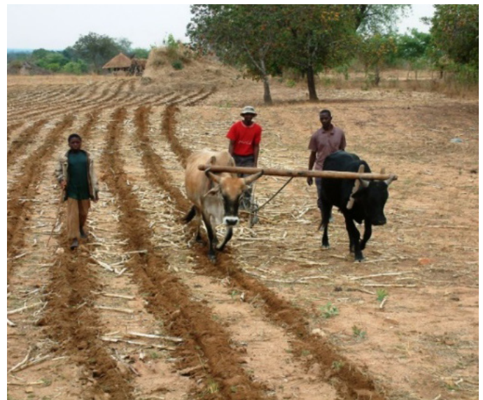
From overall ploughing (top) to conservation farming animal draft power minimum tillage (below)