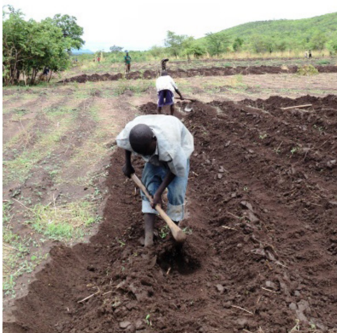
Overall soil movement: ridging with a hoe