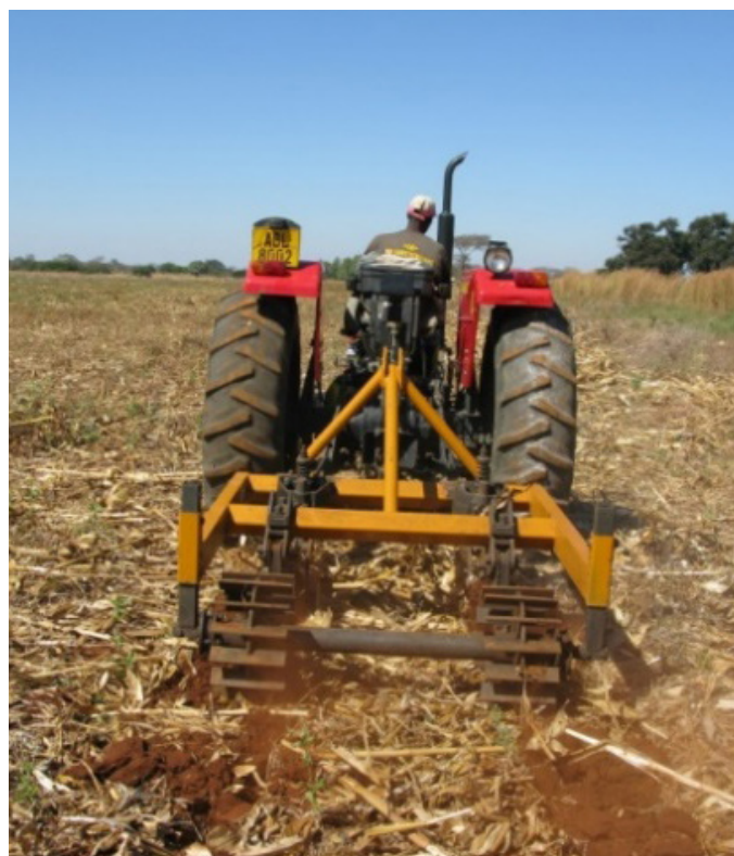
CF mechanized minimum tillage