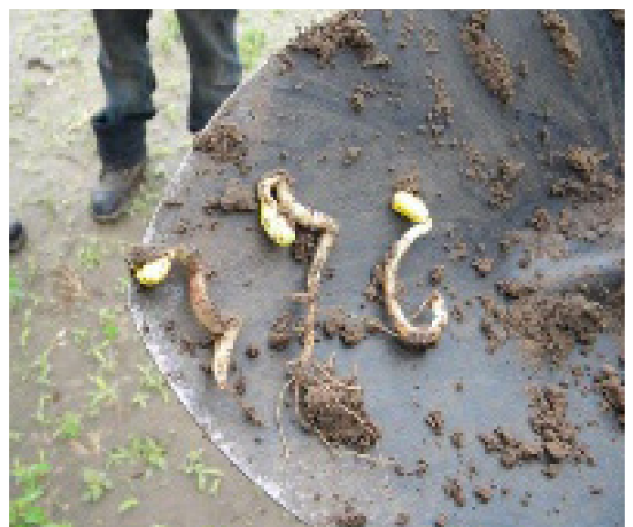
Emerging tap roots