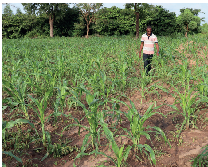
Gapping from inaccurate planting depth

The standard planting depth in ridge holes established on ploughed fields is often uneven with some seeds planted too shallow and some too deep. This results in poor plant emergence. When seeds are planted too shallow , they will emerge after very light rain and wilt or die if more rains do not soon follow (this was seen in parts of Northern Ghana during the 2019 season). When they are planted too deep , they may fail to emerge at all. The gapping (see the photograph below) will lead to low yields.