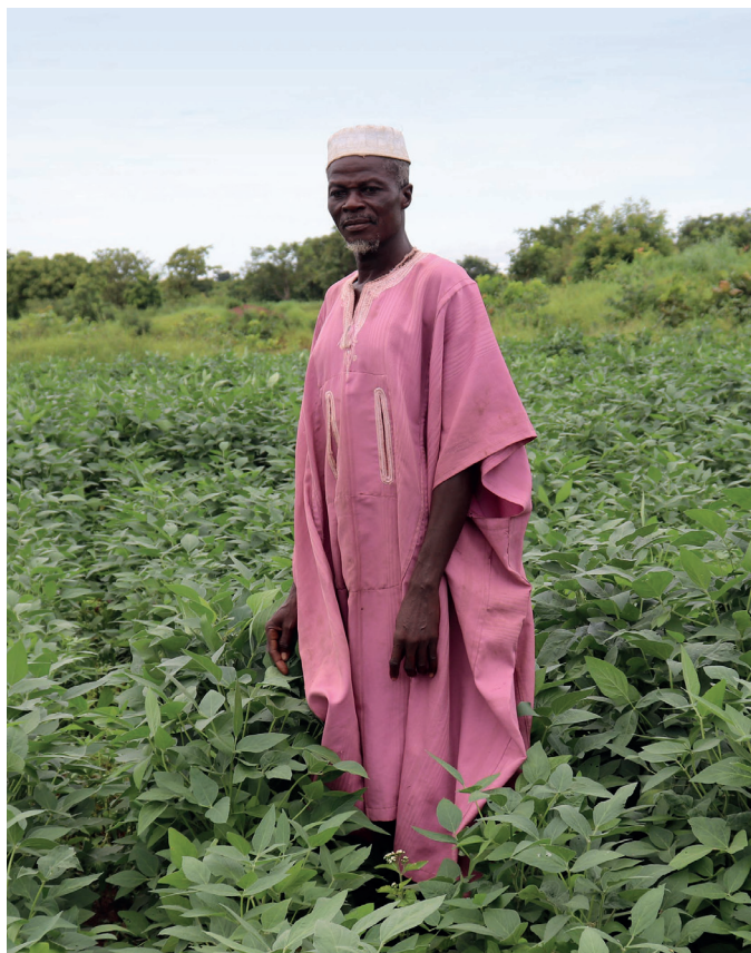
Soya crop planted early