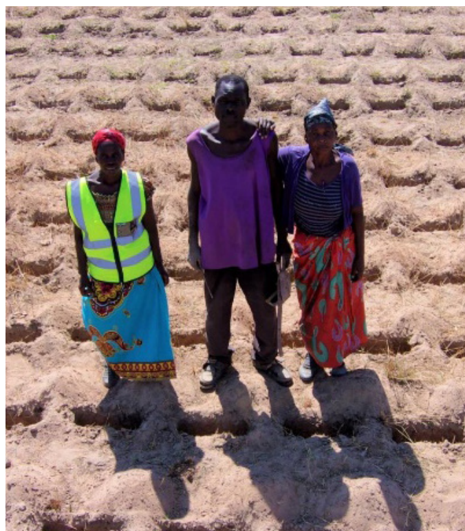
Minimum tillage: CF allows permanent planting