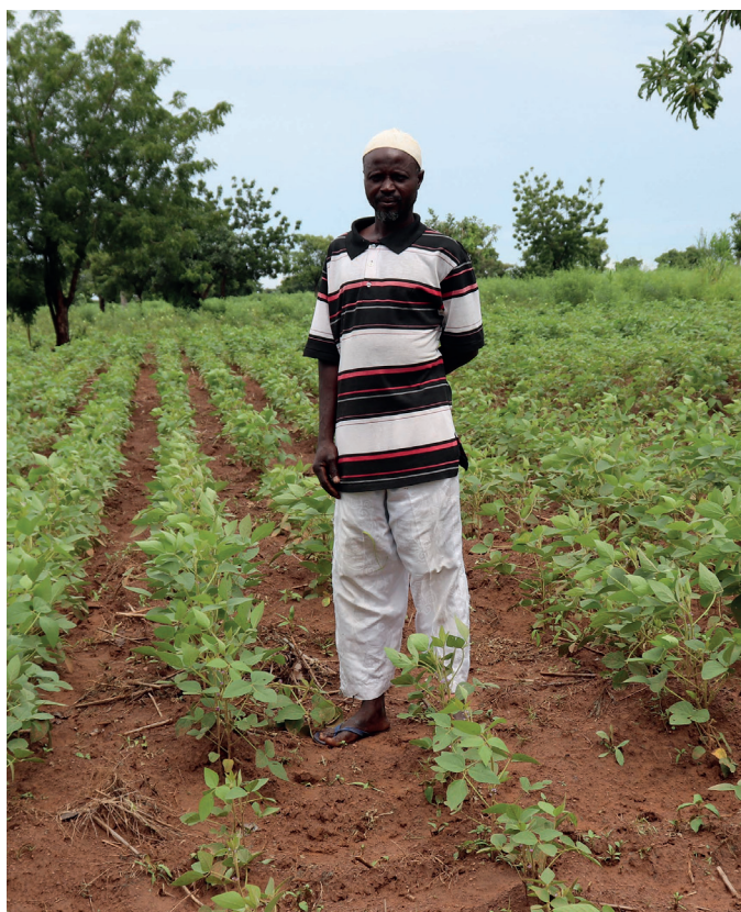
Soya crop planted late

Ploughing is tougher after the post-harvest period up to the first planting rains. The ground is firm and baked and it is much more difficult to pull through the whole surface area of a field once the soils have hardened. It is time consuming and fuel consumption increases, as does the wear and tear on machines and animals. CF MT which involves turning over (ripping) only 21% of a field's surface area is viable even after the soils have hardened – thus eliminating the need to wait for the first planting rains to trigger land preparation