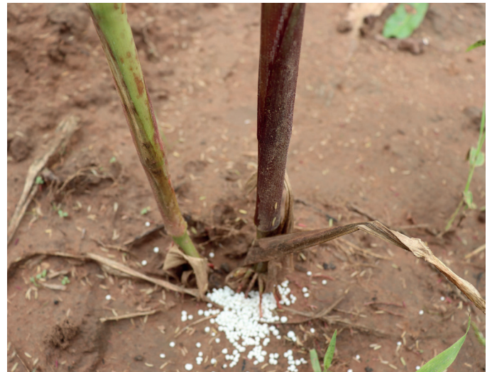
Conventional surface placement of NPK fertiliser

By restricting the seeding and the application of fertiliser to rip lines, more accurate seedling rates and depths can be realised in CF MT practices. The farmer who planted later (opposite, top) is experiencing poor crop emergence and will suffer low yields.