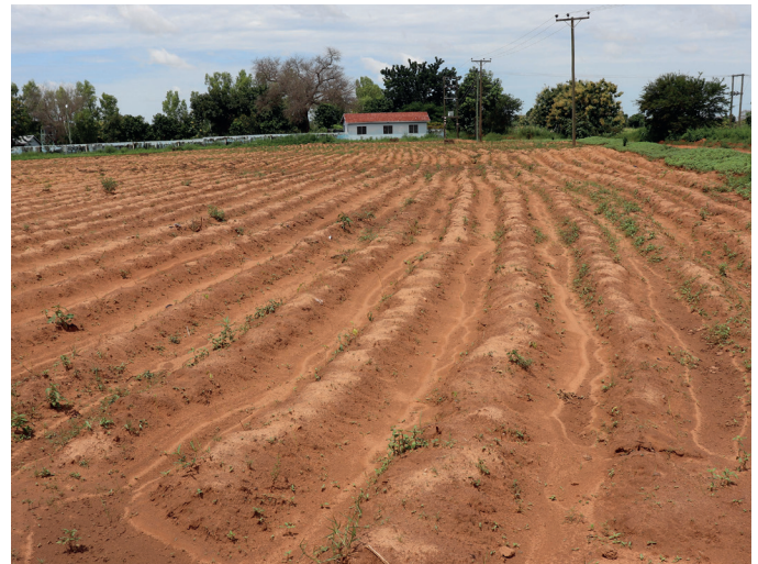
A field that has been ridged, with clear water runoff effects and drying out on ridge tops

The problem with this application method is that heavy rain will wash the fertiliser into the furrows so much will be wasted. Also, NPK contains phosphate, which dissolves slowly and should be applied under the soils at planting for better results.